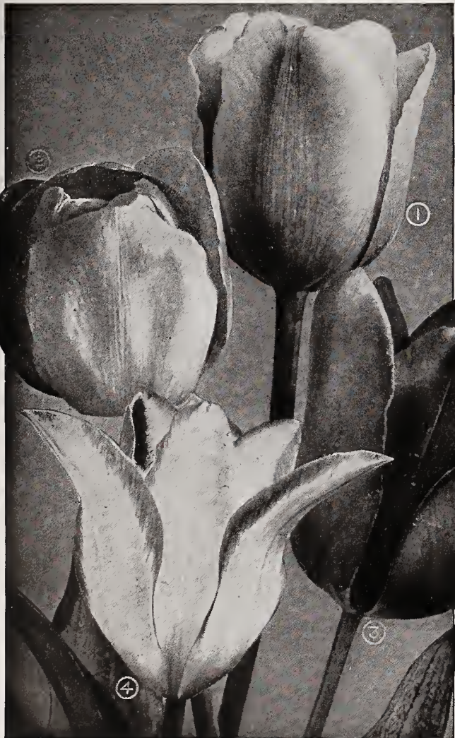
COTTAGE TULIPS—(1) Inglescombe Pink, (2) Inglescombe Yellow, (3) Gesneriana spatulata or major, (4) Picotee